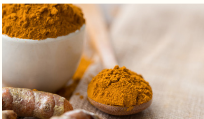
SPICES SUCH AS GINGER AND TURMERIC

Tea lovers are always craving something unique or different. 2 Start with our premium tea, and add these popular newcomer flavors for added menu appeal.